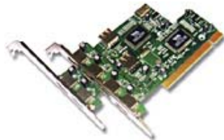
4+1 USB2.0 PCI Adapter USB-4PCI-2.0