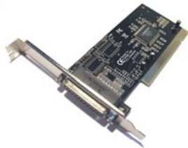
1-Port Parallel PCI Adapter PCI-PARALLEL

Perfect for legacy Serial applications like EPOS, Modem Links or Process Control, the Dynamode PCI-RS232 is the only choice for all your Serial applications!